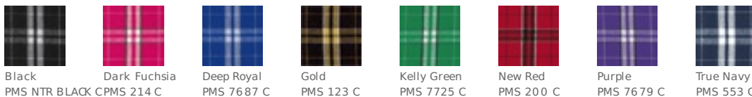
Black PMS NTR BLACK CPMS 214 C